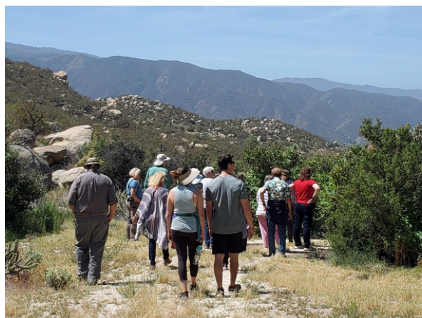
SMG members enjoy a pre-meeting hike